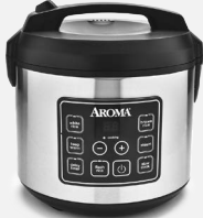
Multicookers/ Rice Cookers