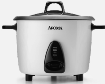
Pot-Style Rice Cookers